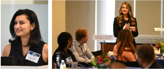
Participants at Jones Day’s 1L Diversity Conference, April 22, 2022, Dallas, Texas.

Jones Day’s annual 1L Diversity Conference, “Perspectives and Pathways,” brings together Jones Day lawyers, Firm clients, and first-year law students from across the country for two days of networking, skill-building, and presentations.